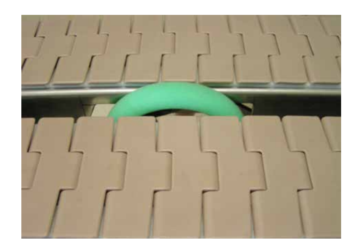
Position of the trim sampling disc when activated.

The CCA is a non-profit federation comprised of eight provincial member cattle associations that provide representation to a national, producer-led board of directors. The CCA's vision is to have a dynamic, profitable Canadian beef industry with high-quality beef products recognized as the most outstanding by customers at home and around the world.